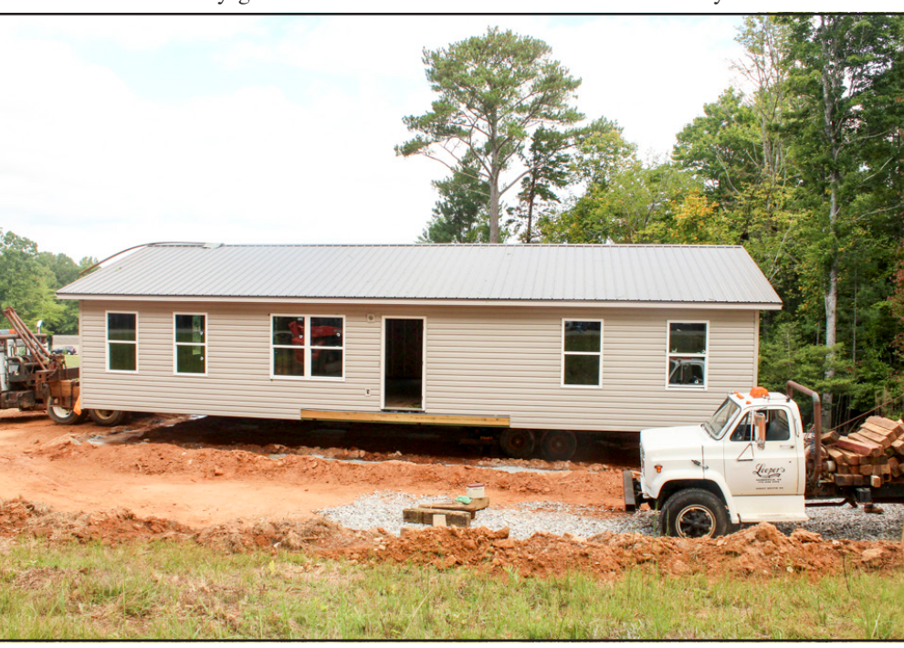
The second Panther House at its "forever home" in the county after being delivered from Union County High School Sept. 3.