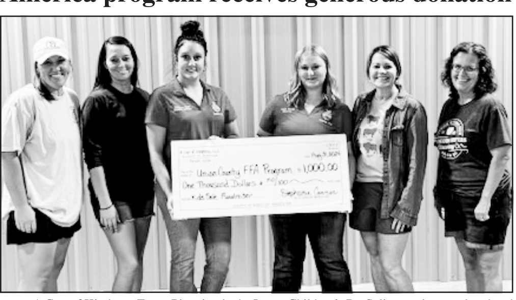
A Cup of Kindness Event Planning had a Large Children's Re-Sell event last weekend and donated the proceeds to local The Union County Schools FFA program through the FFA Alumni & Supporters Group.