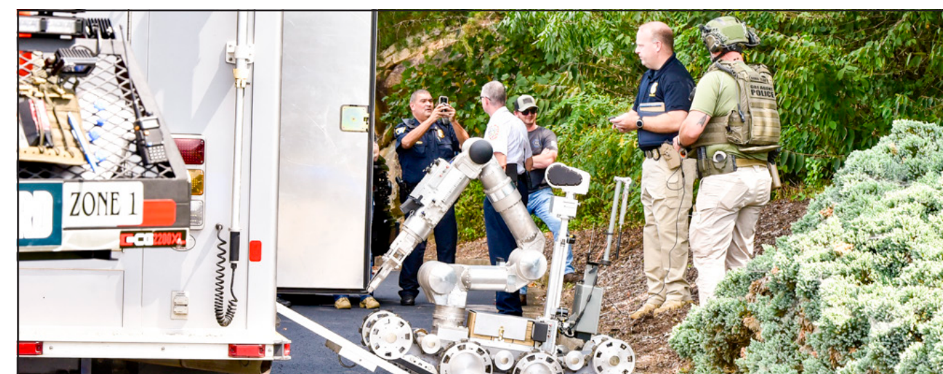
The GBI Bomb Disposal Unit sent a robot into the bank to check for explosives Monday, Sept. 9