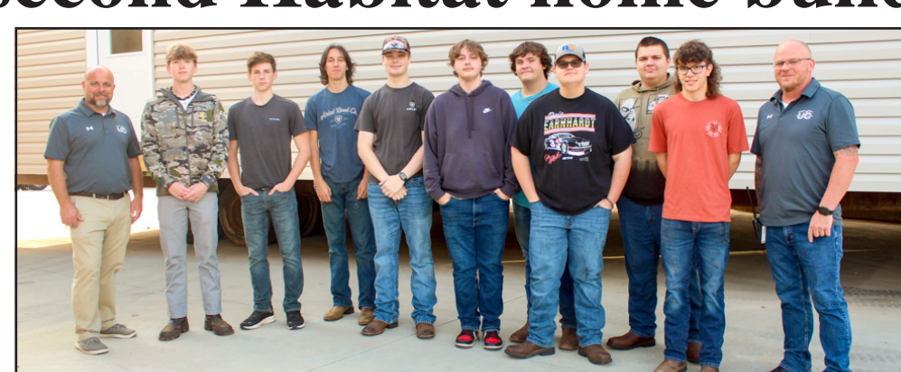
UCHS construction students and educators proudly posing with the home they built to house a local family with Habitat for Humanity.

"It's much slower-paced than the real world, but it does provide students with See Habitat Home, Page 7A